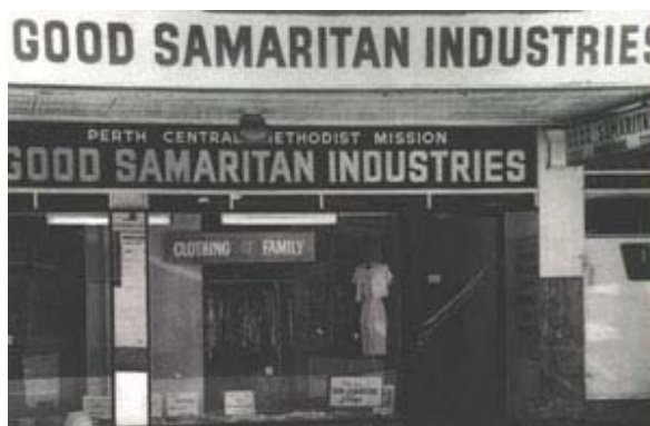
Figure 1: Good Samaritan Industries is a Perth institution

October 2011: Delegates were invited by Good Samaritan Industries for a tour of their premises in Canning Vale at the culmination of the conference. Good Sammy creates employment for 250 people with disabilities as a result of their recycling operations. Second hand clothing, household goods and furniture that are collected and sorted are sold through their 25 stores located throughout Western Australia. Additionally, Good Sammy's provide electrical, mechanical and light assembly contract work for local businesses.