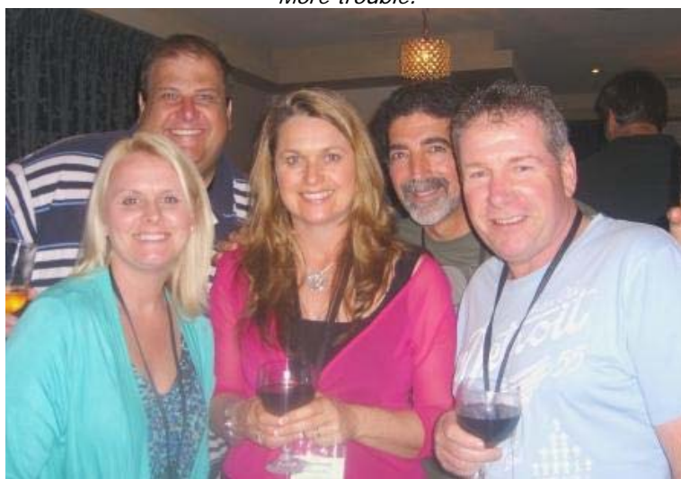
Not so much trouble